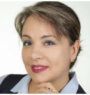
Argentina Vidraşcu / ROM